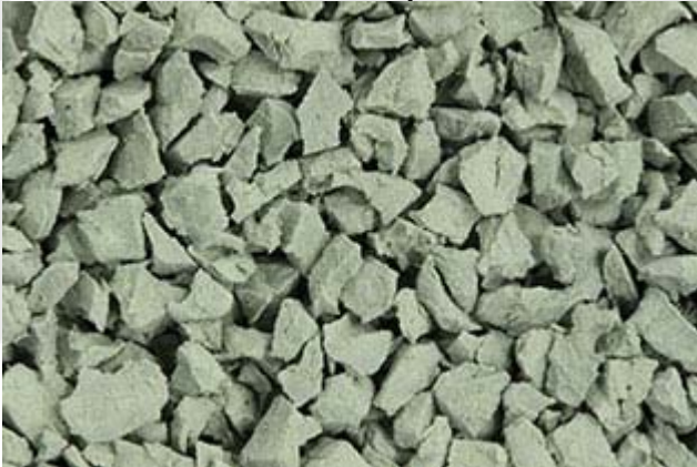
Before UVA exposure